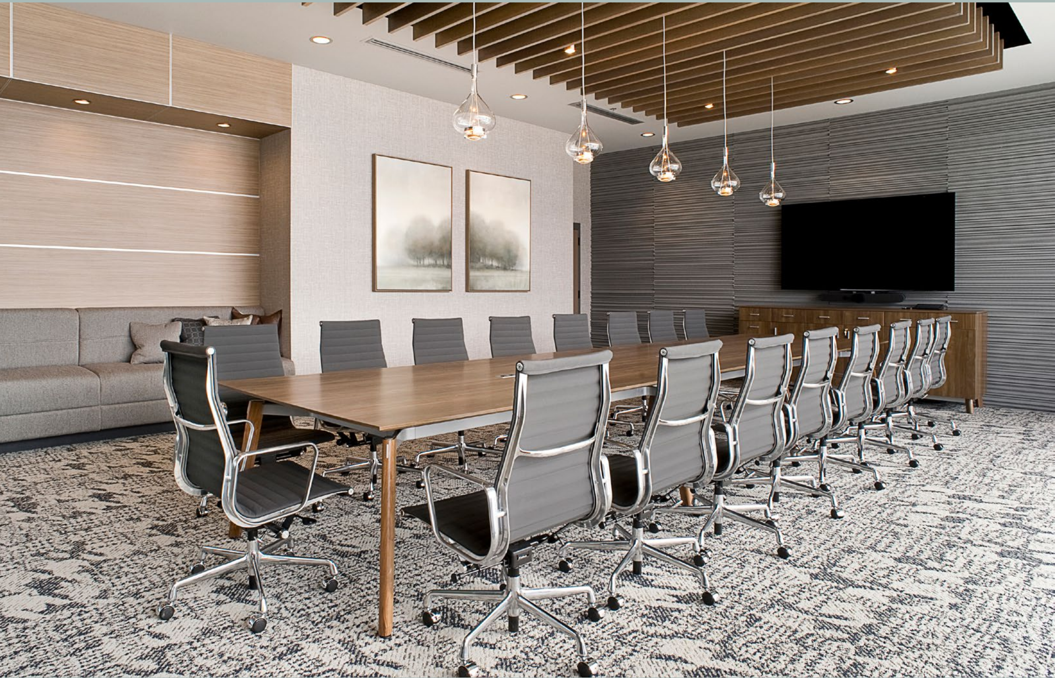
← Ligouri Conference and Credenza