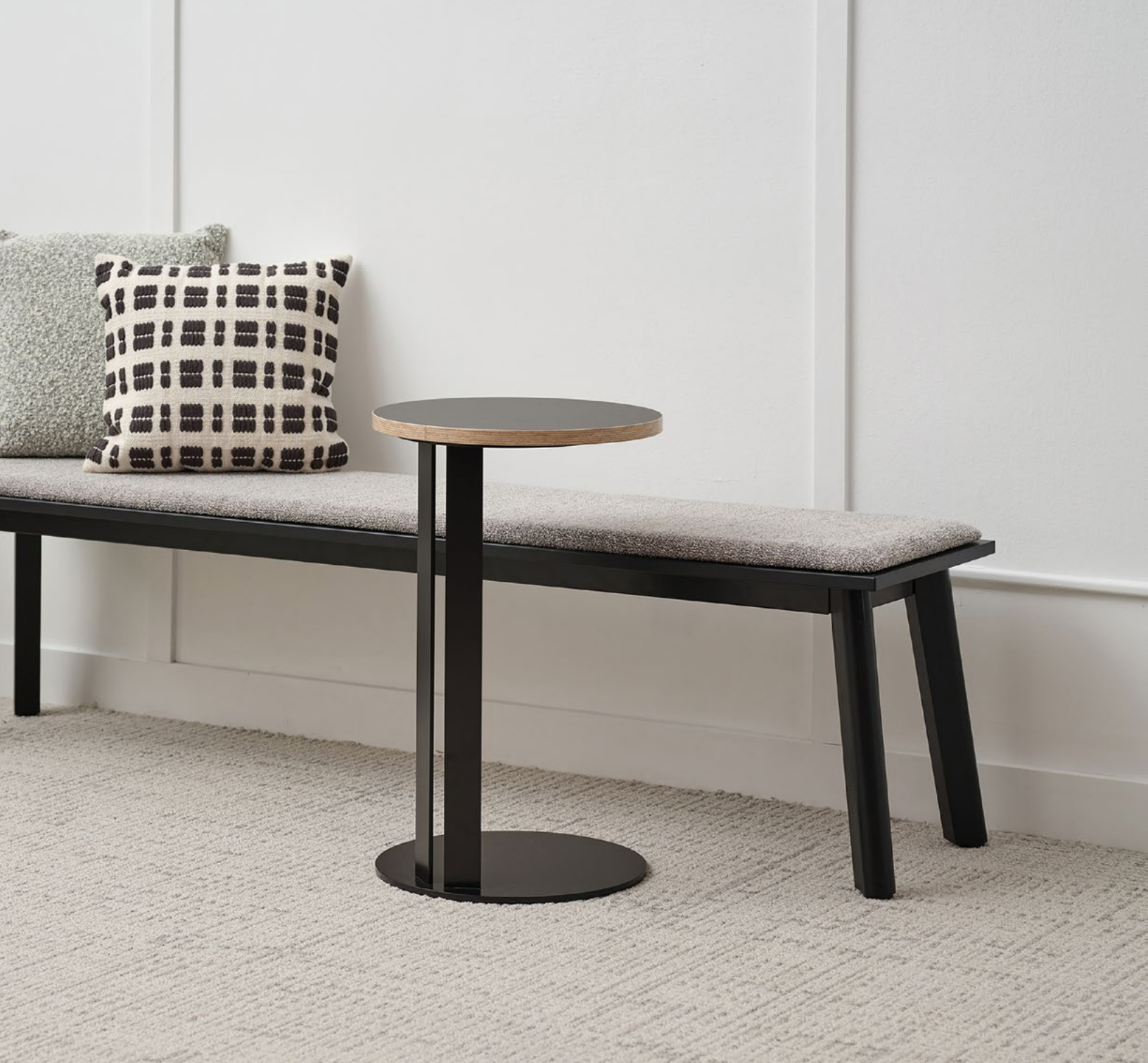
← Tangent Laptop Table + Ligouri Bench with Cushion